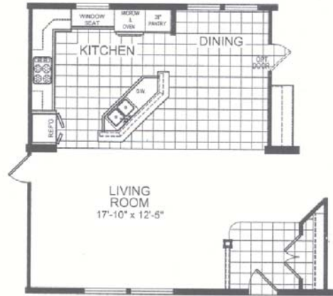
OPTIONAL ULTIMATE KITCHEN